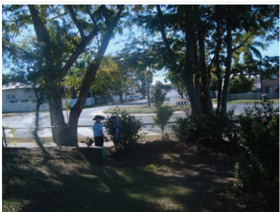
Tennis courts garden