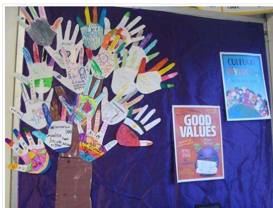
In 1/2T we celebrated Harmony Day by making a "hand tree".