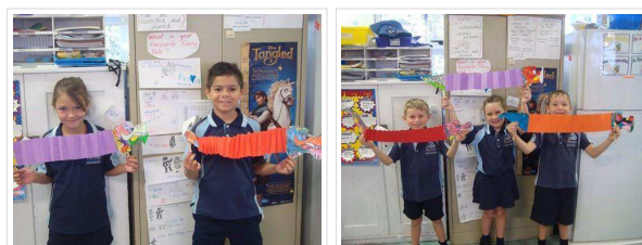
In Design and Technology we are making puppets from different materials. Here are our Chinese dragon puppets.